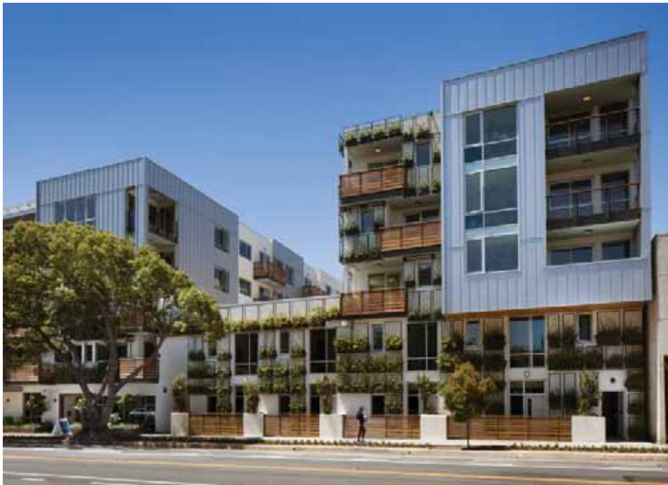
Sway Santa Monica, California